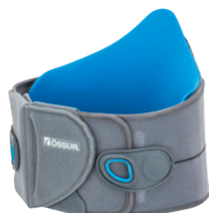
Miami LSO™ Advanced Compression