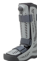
Rebound® Air Walker