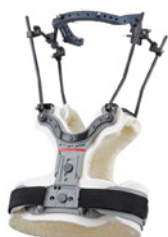
Resolve® & Lil' Angel® Halo