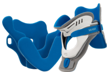
Miami J® Select Collar Set